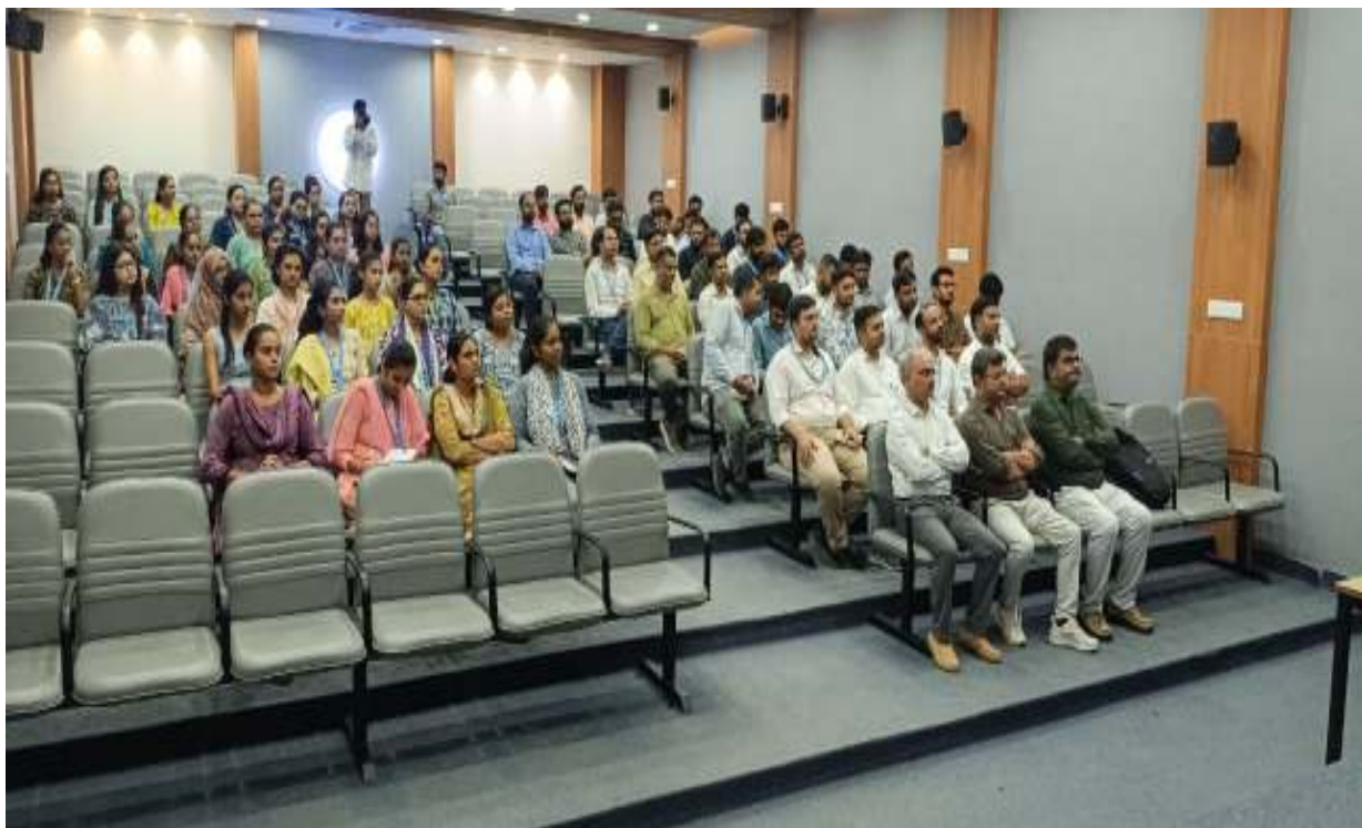
Glimpse of participants attending a session